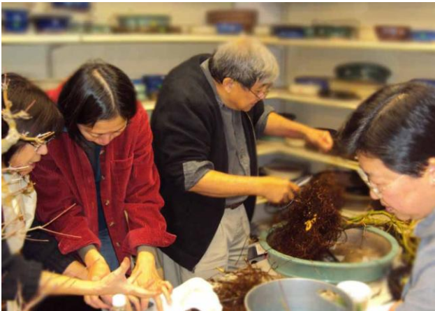
An HBS workshop with the Houston Chinese Bonsai Society

Now is the time to check your supply of akadama, pumice, lava or any other potting materials you need. If you mix different sized soils using equal parts APL, you will be ready for all to come. Just add a handful of something if you need to alter for some special plant. I usually add a bit more akadama for Chinese Elms.