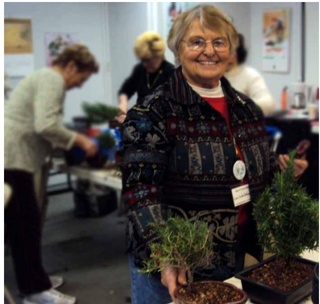
HBS Rosemary bonsai workshop for the American Herb Society