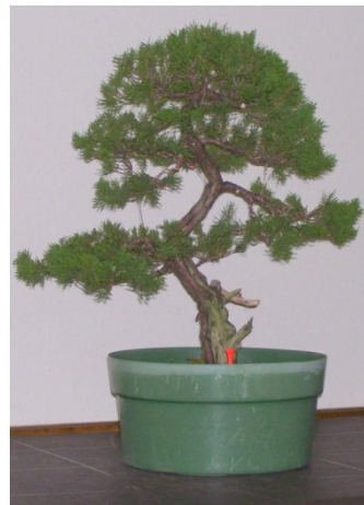
Finished juniper. A golf tee marks the front.

turn the tree and examine it from all sides to determine which view gives the best taper." Other elements may eliminate that view as front, but that is where you must start.